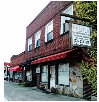
His Ministries' Buildings